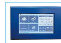
LCD touch screen