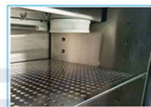
HEPA filter (for water jacket)